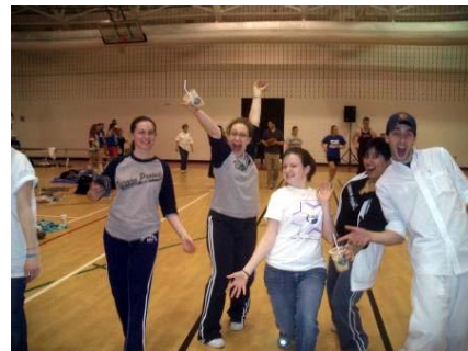
Mu Lambda at the American Cancer Society's Relay for Life

Road Rally, a Rochester Amerks hockey game, and a number of invasions of local restaurants, both planned and impromptu.