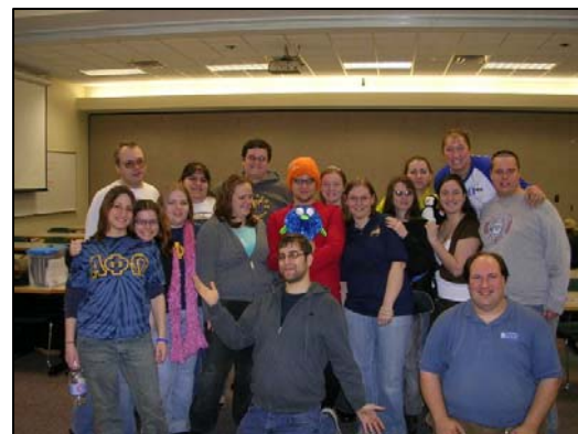
Chi Pi Brothers at SLED at RIT