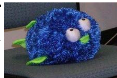
Boing, Chi Pi Chapter Mascot

After this wonderfulness, many plans were made to go back to Fredonia and have fun. Brothers visited and had wonderful times, sharing with Boing-y goodness. Pictures were shared, Laughs were had, and exhaustion reined supreme. Great fun, great brothers, and great times. Can't wait for next SLED!