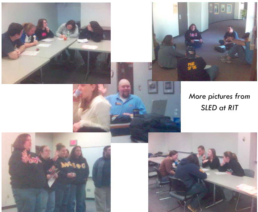
More pictures from SLED at RIT