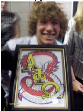
One of the many gifts AZL received